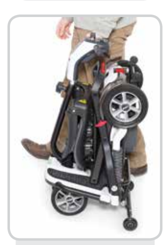
Easy to Transport